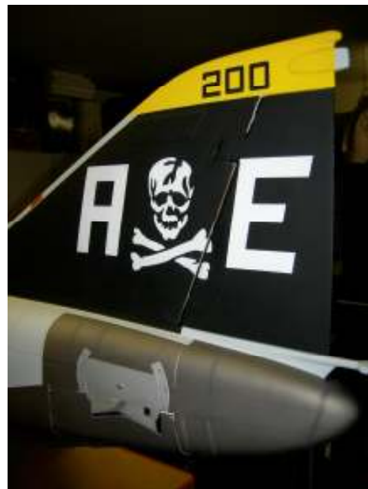
The vertical fin fit nicely without additional shaping

I began with the rudder. This is the only control surface on the model that requires hinging and some time is required for fitting and notching the pin hinges to get the proper clearances and recommended 25 millimeter throw. Parts fit was excellent, however, and the predrilled holes were accurately placed. I was also impressed with the engineering of the linkage system, which consists of two short control arms connected to a sturdy bellcrank. A very short but substantial metal rod is embedded in the bottom of the rudder that fits tightly into a notch on the top of the bellcrank. There is zero slop in this system. Pay attention to the orientation of the bellcrank slot as it slants from back to front. If you miss this, the fin will not sit flat on the fuse. Remember to grease the bearing sleeve and file a small flat spot on the bellcrank for the control horn setscrew. Use thread locker on the setscrew.