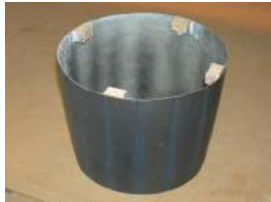
Screws were passed through mounting blocks for tail cone installation

While the instructions don't address how to attach the tail cones, I decided to glue small wooden blocks and bolt them to the aft former. Spacers were ultimately required at the top block to achieve some down thrust. There were also no instructions for the arresting hook, so I simply epoxied two ply plates in the keel of the tail and bolted it in place. I installed a third bolt into the lower stab cover plate to give this hatch additional lateral stability.