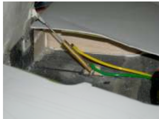
Inner door cylinder ram mounting. Note carbon fiber stiffening of wing root

The inner gear doors are hinged to the wing root, which is constructed with a very thin layer of fiberglass. A reinforcement strip of glue had been run down the centerline of the root, but it didn't provide much stiffening. Since the pin hinges would be attached to this surface, and the air ram would put force against the root, I elected to reinforce it with carbon fiber cloth and epoxy resin. Some experimentation was also required to find the right mounting points for the supplied inner door rams to insure adequate travel (see photo).