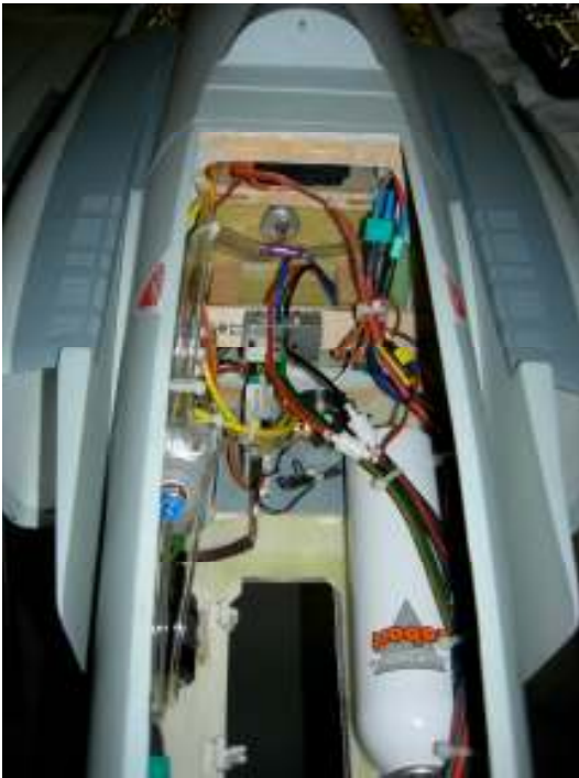
UAT, ECU and valves mounted to plate in nose section