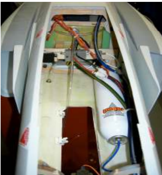
Center tank shown with ply brace, air and brake valves attached

The nose gear doors are straightforward installations. I did use small panel screws to reinforce the hinge attachment. It is a good idea to turn the hinge pin around on the front hinge so the door can be removed at a later time. I found that the air ram supplied with the hardware kit didn't have enough throw to open the door, so it was replaced with a larger unit. The nose was now aligned on to the main fuse and all six bolts aligned perfectly.