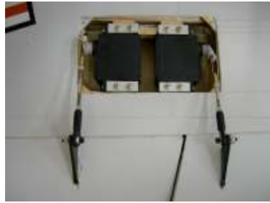
Final servo installation

To finish off the wings, I routed a hole in the wing root just ahead of the main spar rib for the air lines. In the fuse this is an open space just behind the rear tank former. The wings were test mounted and as with all other major components, fit was excellent with no gaps at the root. The wings slid easily over the carbon fiber spar that runs through the fuse, and the attachment bolts at the rear spar and leading edge tab were perfectly aligned.