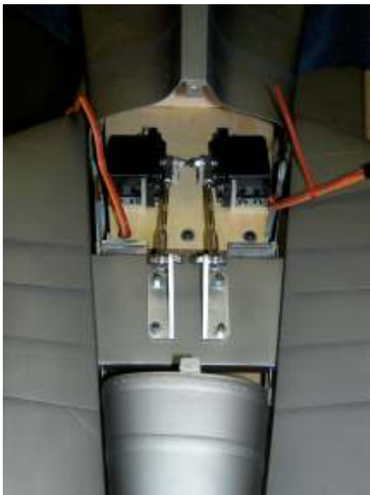
Short linkages and factory mounted bearings and control horns made stab install easy, slop free

The stab installation was next. Bolting the factory pre-fabricated stab and its bearing plate into the tail took only a few minutes. Since the metal control horns were also pre-fitted, the primary work on the stab was servo installation. As with the rudder, the design of the stab mechanism resulted in a very secure installation with no free play.