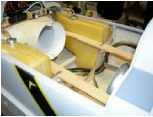
Saddle tanks fit nicely and are easily accessed

The manual calls for the front nose section to be mounted to the fuse at this point, but I elected to defer this step until later as my workshop is somewhat confined and the two sections are more easily worked apart.