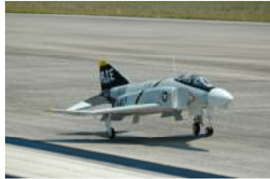
The F4 touching down

You will also need to keep an eye on tire pressures. The tires are tubeless inflatable in design, making them easy and cheap to replace. I found a pressure of about 40 pounds works well. Be careful not to over inflate.