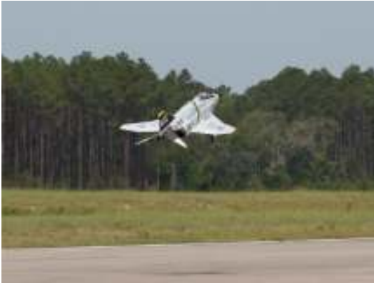
The big Phantom takes to the air on a test flight

I originally had mixed feelings about the amount of downthrust inherent in the design. On the positive side, it keeps the stabilizer out of the exhaust buffet. I was concerned, however, that it might produce significant pitch change at various throttle settings or hamper the transition to inverted flight. None of these tendencies were apparent. I was also pleased that the airplane pulled straight up into verticals with no rolling moment. As you can see from the photos, slow camera passes are what this plane excels at.