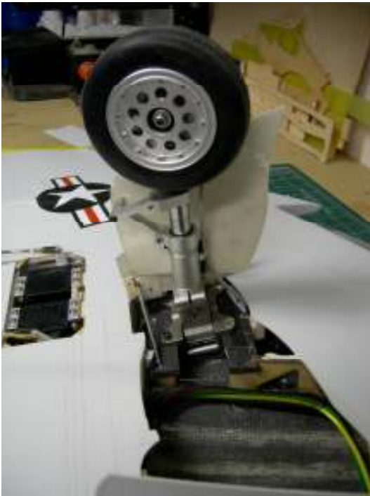
Strut cover glued and wire tied to strut with wood block spacer. Note outer door spring

The instruction manual called for the servos to be mounted to a ply plate affixed to the top of the wing. I had been told that this had resulted in flexing of the skin when the servos were actuated on early prototypes. My production kit had added ribs for strength on either side of the servo compartment, and a set of ply tabs affixed to the bottom framework of the wing. None of this was in the instructions, but these tabs were positioned perfectly for servo installation so I intuited that this was their purpose. They turned out to be just slightly wider than the 8611a servo tabs so I fashioned ply extensions (see photo). I did elect to replace the clevises supplied in the hardware package with ball links to prevent binding, as the geometry of the linkage changes slightly as the control surfaces move.