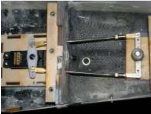
Note the extra fin attach bolts, nice tight linkage

attachment bolt as specified in the instructions, so I drilled and tapped an additional 8-32 attachment bolt just ahead of the rudder bearing sleeve. This solved both problems. As one more safety measure, I also installed a small 4-40 bolt through the carbon fiber vertical fin spar (see photo). I now have absolute confidence that the vertical fin will remain attached to the airframe.