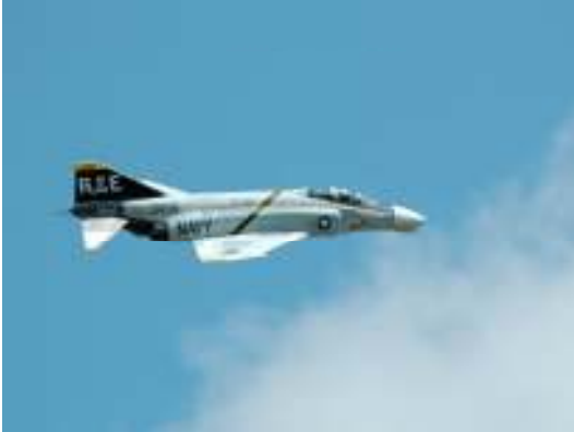
The F4 looks absolutely genuine on a low pass

is a weak spot and should be reinforced and inspected frequently. The engineering of the gear doors requires some retrofitting and experimentation but can be made to work.