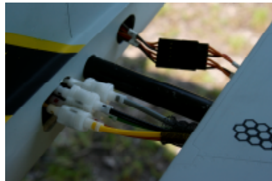
Robart quick disconnects and Ashlok servo connectors make for quick set up at the field

I wish I could say that the initial test flight was uneventful, but that would not be true. After 300 feet of ground run on the asphalt runway, the big Phantom lifted off nicely. I turned downwind, picking up a bit of altitude and speed. At this point, the ECU sensed a problem with voltage at the receiver, and while I noticed no loss of control, the ECU shut the engine down. Low and full of fuel, I immediately turned back and just made the runway. The landing was heavy, however, and one of the ply main gear plates delaminated and partially pulled free. This led me to retrace my steps and reinforce the plates with additional glue.