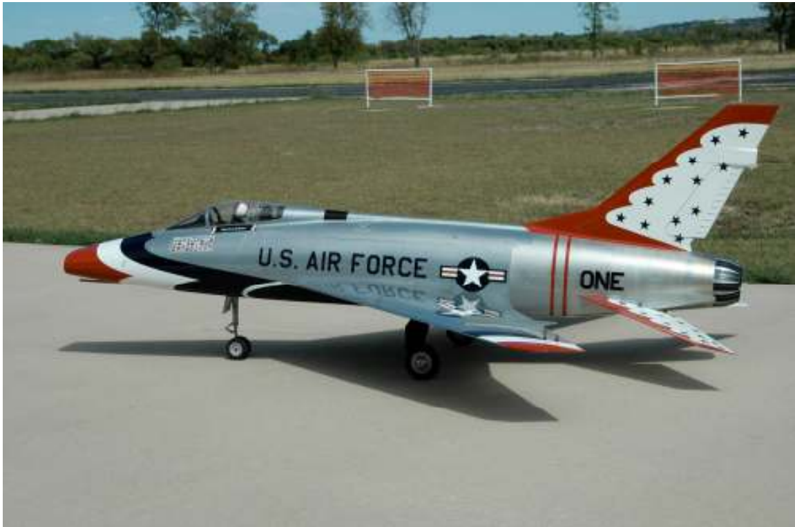
The completed model showing many of the effects that can be achieved with Metal-Kote

Some of the advantages of Metal-Kote are that the final product is as durable as any painted finish and requires no maintenance beyond any other painted surface. Markings can be applied on the surface with no additional prep work, and can be sealed under an over all clear coat.